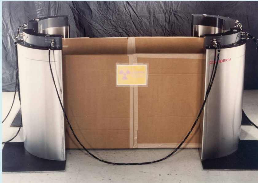
The WM3500 can be used with larger objects by separating the pillars.