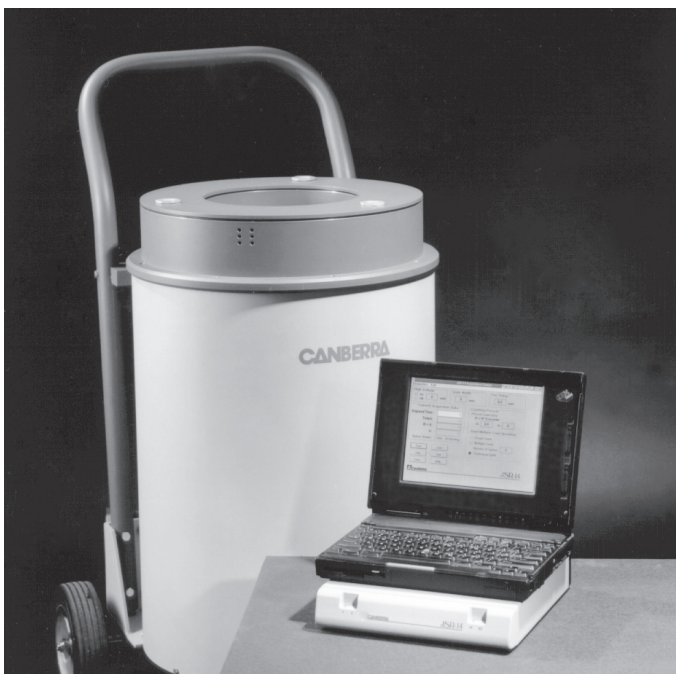
Small size and battery operation make the JSR-14 ideal for portable applications