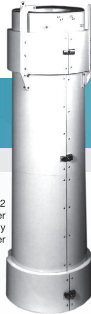
Modified Model JCC-62 Universal Fast Breeder Reactor Subassembly Counter