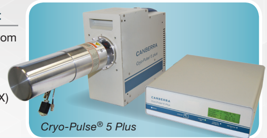
Cryo-Pulse® 5 Plus