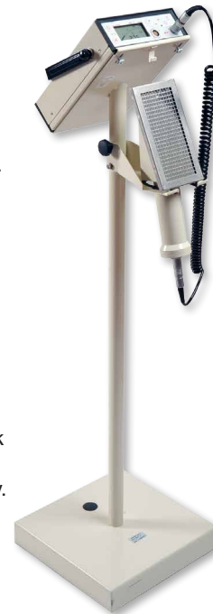
Figure 2: MIP 10 Digital on its pedestal with CSP probe support (option).

MIP 10 Digital can be fixed on a pedestal for use as a control survey meter. For example, at exits of working areas. The MIP 10 Digital pedestal is 1 m (3.3 ft) high. It integrates a hook for probes. Its lead base ensures efficient stability.