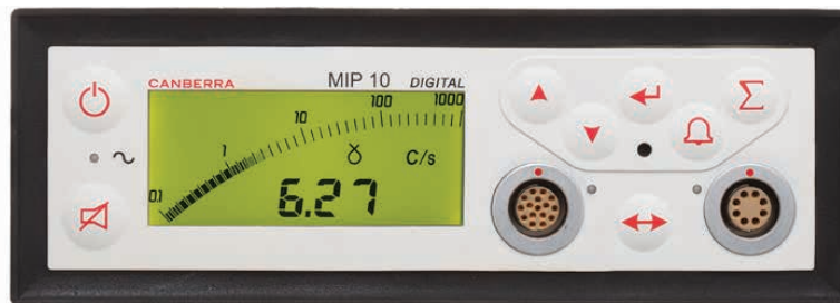
Figure 1: MIP 10 Digital front panel.

than the instrument, measurement quality is no longer dependent on cable quality as with older analog systems. Also, the probes can be plugged in “hot” without powering down the survey meter – the instrument immediately recognizes the probe and automatically switches measurement mode to the mode required for that specific probe. Calibrations and QA measurements can also be performed directly with the probe, without even using the instrument, by connecting the probe to a computer with calibration software, allowing the MIP 10 Digital to remain deployed in the field.