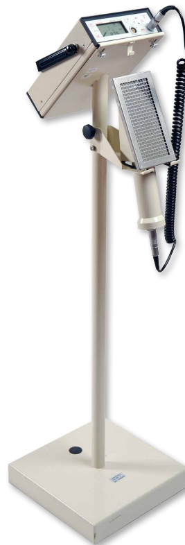
Figure 2: Avior 2000 on its pedestal with CSP probe support (option).

The Avior 2000 pedestal is 1 m high, and incorporates a hook for probes. Its base ensures efficient stability.