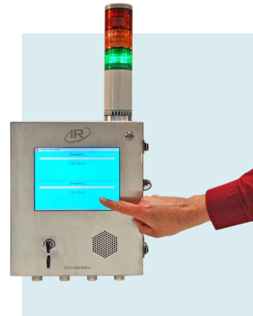
Model iR7040 wall-mount ratemeter

The iR Ratemeter supports an enhanced Source check functionality, allowing the user to manually or automatically perform source checks of attached probes and detectors with that capability. The source check results can be plotted for long term performance and stability verification. Individual tests can also be compared to the expected value to alarm on out of specification responses.