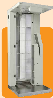
Argos™ AB Gas-Flow Whole Body Contamination Monitor