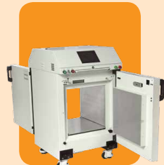
Cronos Gamma Object/Tool Monitor

CANBERRA offers a range of contract options to suit the unique support requirements of your site or fleet. Whether your goal is to maximize the performance of your CANBERRA monitors, or to verify/assess the performance of your entire contamination monitoring program, our team of professionals (Certified Health Physicists, Engineers, technical and application support experts) is available to work with you.