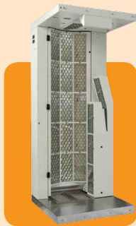
Argos™ TPS Family of Gasless Whole Body Monitor

>> CANBERRA’s contamination monitor support and service contracts are designed to help you get the most from your Argos, GEM-5, Cronos, Sirius, and even non-CANBERRA monitors.