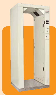
GEM™-5 Gamma Exit Monitor