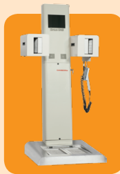
Sirius™-5 Hand, Cuff & Foot Monitor with optional Frisker shown